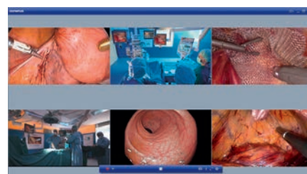
Procedure / OR status: Overview screen in the OR manager room